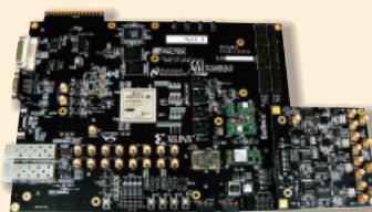
HYUGA "HYUGA is a PALTEK original evaluation board developed by the comprehensive expertise of the engineering group."